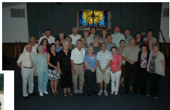
The Original Crew